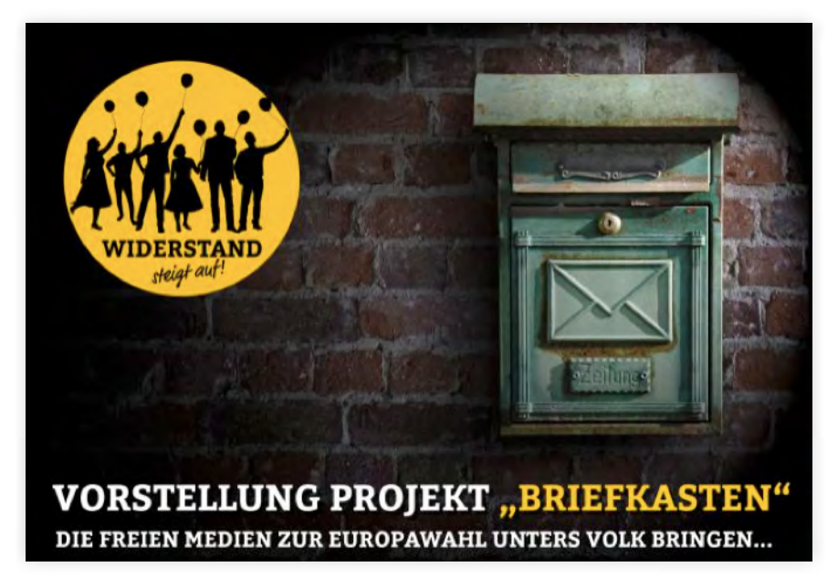
Above: Patriot Peer Project Mailbox Campaign

In Germany, in addition to online outfits like Philosophia Perennis<sup>22</sup> far right activists have begun the physical distribution of material. Our researchers discovered a campaign coordinated on the hard right social network Patriot Peer to distribute tens of thousands of fliers to domestic letterboxes in Germany.