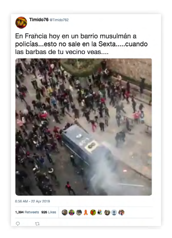
Above: Algeria being presented as France

Lastly, social media has come to be seen as a mirror of society, unmediated by the bias of the editorial class. Even if this had been true at the beginning it is now false. It is simply too easy to buy fake accounts<sup>31</sup> to promote fictitious content, as this example from Spain shows.